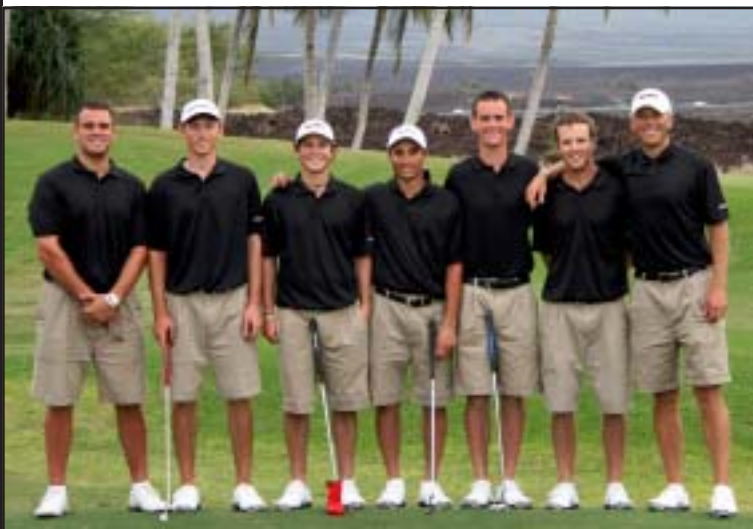
The Pacific golf team enjoys some time after play at the UH Hilo Intercollegiate in Waikoloa, Hawaii.