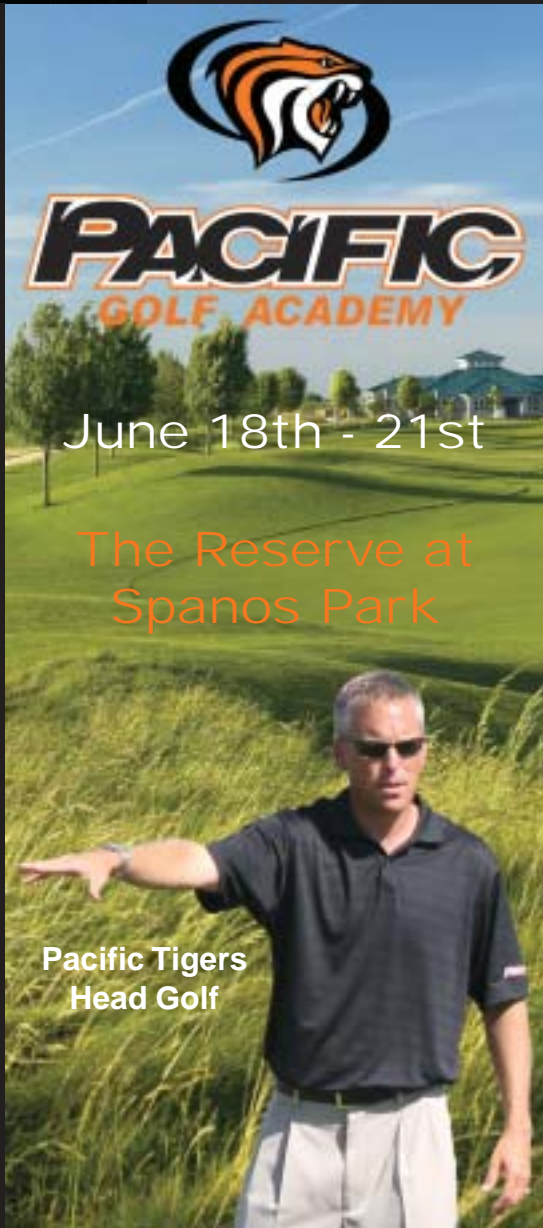
Pacific Tigers Head Golf