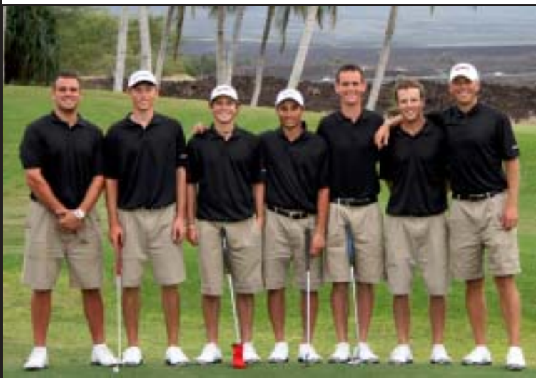
The Pacific golf team enjoys some time after play at the UH Hilo Intercollegiate in Waikoloa, Hawaii.